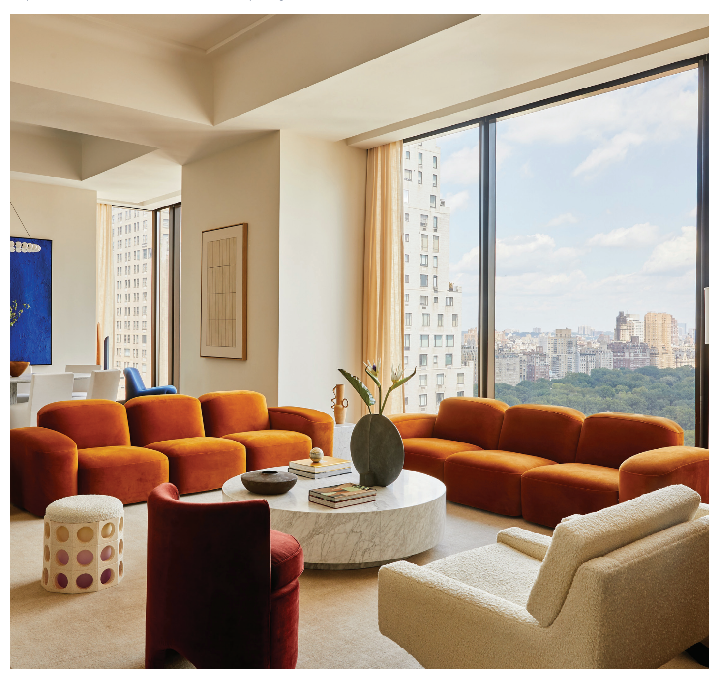
© 2024 Sotheby's International Realty. All Rights Reserved. Sotheby's International Realty® is a registered trademark and used with permission. Each Sotheby's International Realty office is independently owned and operated, except those operated by Sotheby's International Realty, Inc. All offerings are subject to errors, omissions, changes including price or withdrawal without notice. Equal Housing Opportunity.